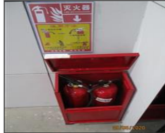
Photo of fire safety equipment 41 Fire extinguisher.JPG