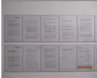
Photo of the code of conduct on display 71 amfori BSCI coc and poster displayed.JPG