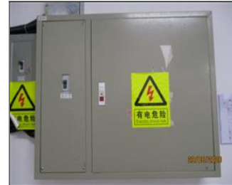
Photo of the inside of the main production hall 911 With warning sign.JPG