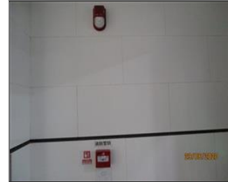
Photo of fire safety equipment 42 Fire alarm bell.JPG