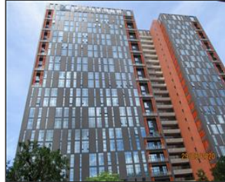
External photo(s) of the production unit(s) 13 Production building.JPG