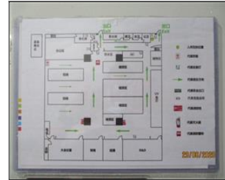
Photo of fire safety equipment 44 Escape route map.JPG