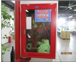
Photo of fire safety equipment 43 Fire hydrant.JPG