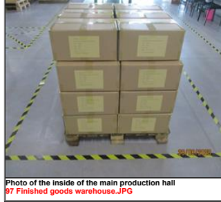
Photo of the inside of the main production hall 97 Finished goods warehouse.JPG