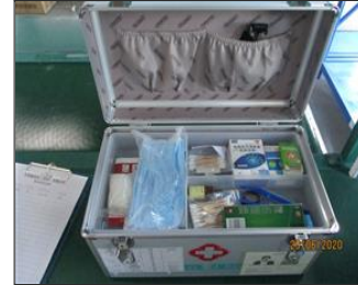
Photo first aid facilities 21 First aid kit.JPG