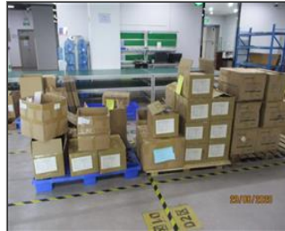
Photo of the inside of the main production hall 91 Incoming goods warehouse.JPG