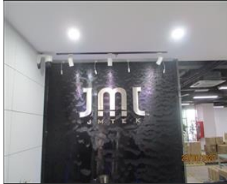
External photo(s) of the production unit(s) 11 Name board.JPG