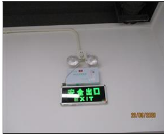
Photo of fire safety equipment 48 Emergency light and exit sign.JPG