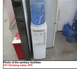
Photo of the sanitary facilities 131 Drinking water.JPG