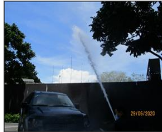
Photo of fire safety equipment 43 Water pressure testing.JPG