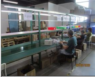
Photo of the inside of the main production hall 92 Assembly and Packing.JPG