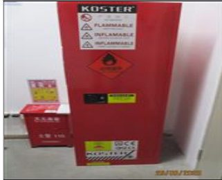
Photo of chemical storage room (if applicable) 31 Chemical store area.JPG